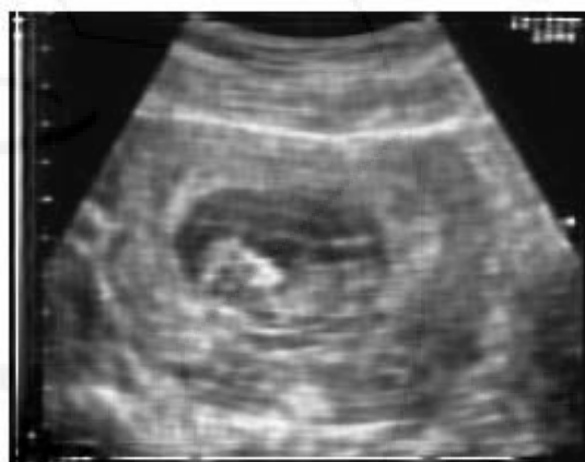
Figure 7: Shows Deblurring with INITPSF for U/S image