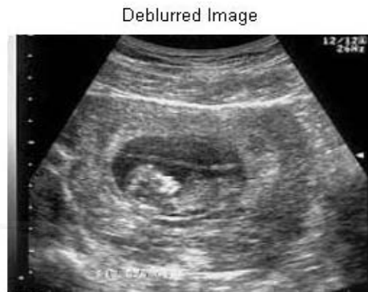
Figure 10. The deblurred Image

The function, FUN, below returns a modified PSF array which deconvblind uses for the next iteration. In this example, FUN modifies the PSF by cropping it by P1 and P2 number of pixels in each dimension, and then padding the array back to its original size with zeros. This operation does not change the values in the center of the PSF, but effectively reduces the PSF size by 2 \cdot P1 and 2 \cdot P2 pixels as shown in figure 10.