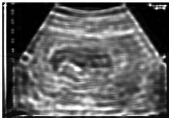
Figure 6: Deblurring with Oversized PSF for U/S image

The third restoration, J3 and P3, uses an array of ones, INITPSF, for an initial PSF that is exactly of the same size as the true PSF figure 7.