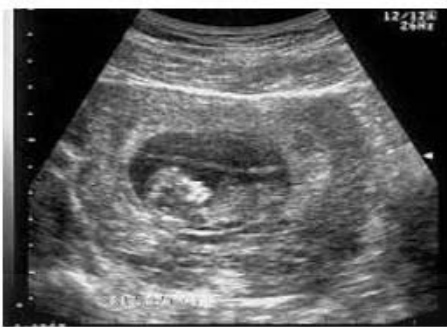
Figure 3: Original Ultrasound image