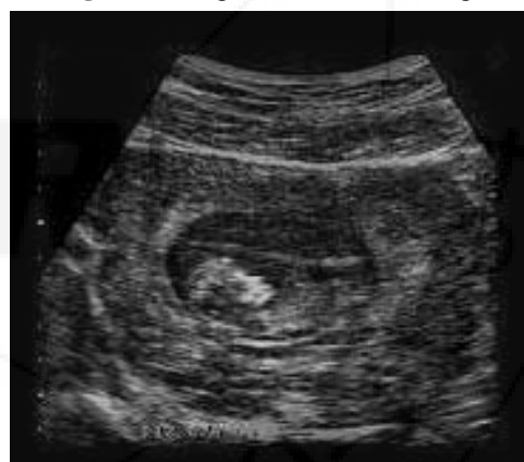
Figure 2: Enhanced Ultrasound using Top-hat filtering