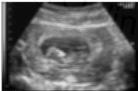
Figure 5: A blurred U/S image using Undersized PSF

The second restoration, J2 and P2, uses an array of ones, OVERPSF, for an initial PSF that is 4 pixels longer in each dimension than the true PSF figure 6.