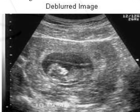
Figure 11: Anonymous function of Deblurred Image

The anonymous function, FUN, is passed into deconvblind last. In this example, the size of the initial PSF, OVERPSF, is 4 pixels larger than the true PSF. Setting P1=2 and P2=2 as parameters in FUN effectively makes the valuable space in OVERPSF the same size as the true PSF. Therefore, the outcome, JF and PF, is similar to the result of deconvolution with the right sized PSF and no FUN call, J and P, from step 4 as shown in figure 11.