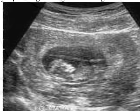
Figure 1: Original Ultrasound image

It performed morphological top-hat filtering on the grayscale or binary input image IM figure 1 and figure 3-2.